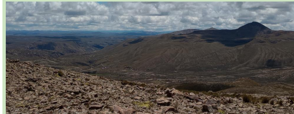
Left: Regional overview with Machu Tanka Tanka peak